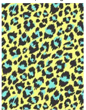
2040/Y Leopard Skin