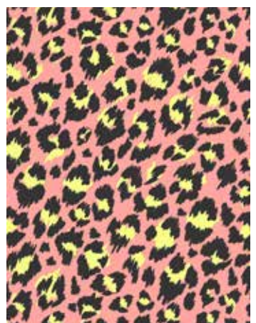
2040/P Leopard Skin